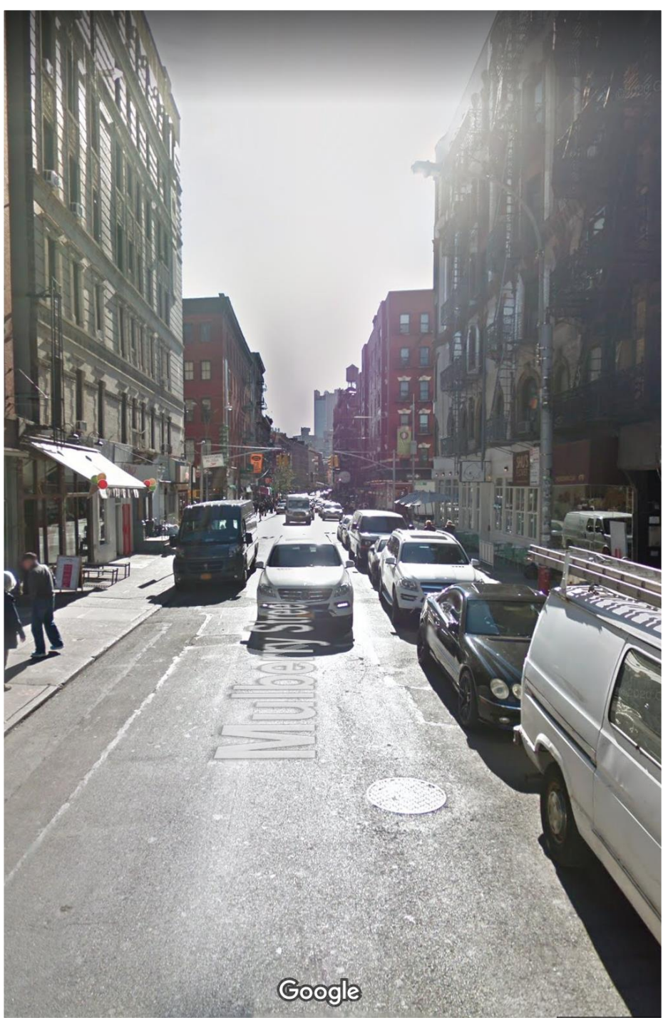
Mulberry Street, New York, 1900 -2016